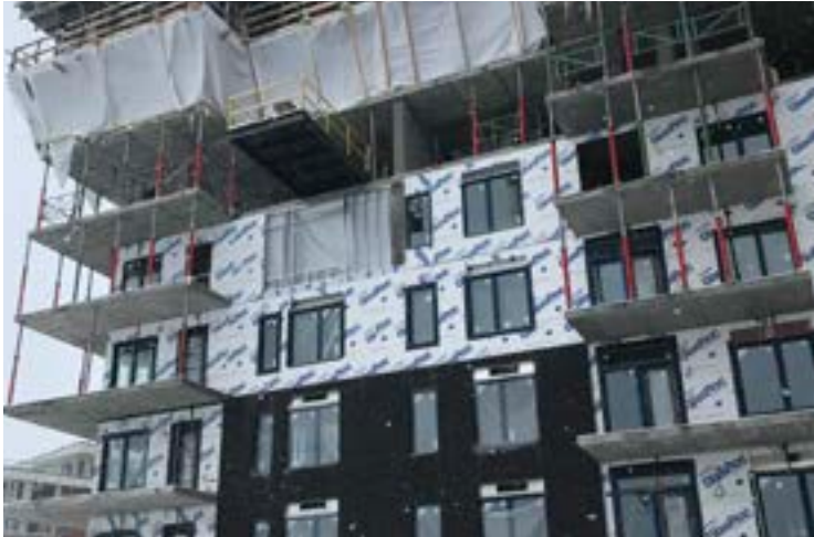
Example of productivity of the D-Max system. The cladding is installed from the ground floor to the third floor, the interior insulation is installed on levels 3 and 4 and the structure is poured on levels 6 and 7.