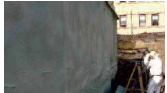
Drainage membrane that will be lifted in front of the foam as the soil is backfilled.