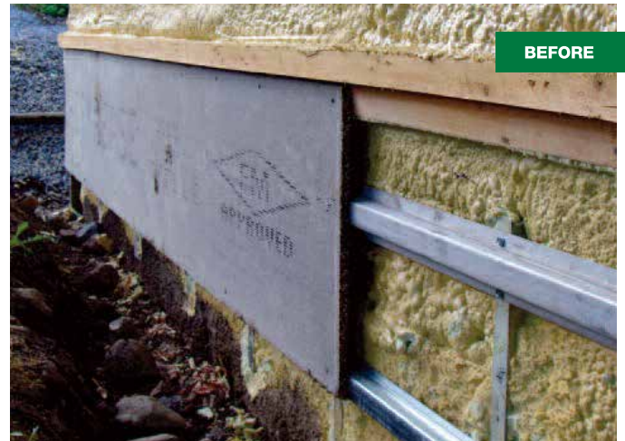
During application of spray foam and z-bars

What about the above-ground portion of the foundation? Many options are available but the easiest option is to install a galvanized Z-bar structure on the above-ground portion of the foundation. This will provide a continuous building envelope system below and above ground. This must be done before applying Heatlok Soya HFO. Once the insulation work has been completed, we recommend installing a light-cement board on the Z-bars. A finish is then applied over the light-cement board once the backfilling has been completed to provide the desired appearance.