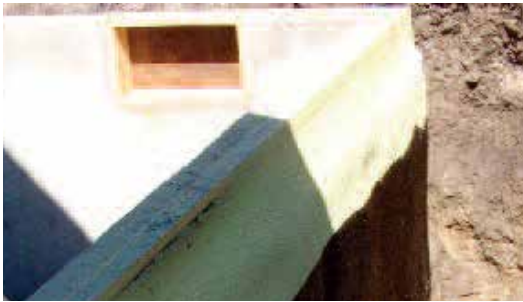
Bituminous coating applied directly over the foam.

Heatlok Soya HFO qualified as a damp-proofing material and when waterproofing is required polyurea product, bituminous coating, or drainage membrane could be directly installed on the foam in areas where water accumulates or the water table is high.