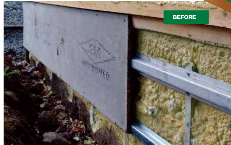
During application of spray foam and z-bars

What about the above-ground portion of the foundation? Many options are available but the easiest option is to install a galvanized Z-bar structure on the above-ground portion of the foundation. This will provide a continuous building envelope system below and above ground. This must be done before applying Heatlok Soya HP. Once the insulation work has been completed, we recommend installing a light-cement board on the Z-bars. A finish is then applied over the light-cement board once the backfilling has been completed to provide the desired appearance.