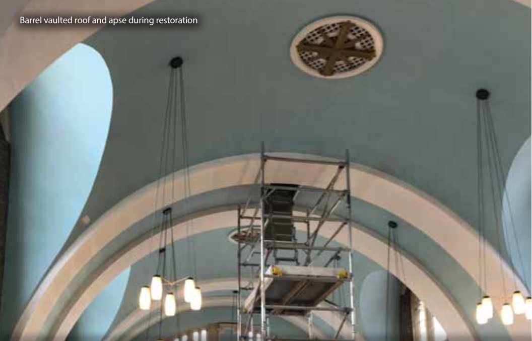
Barrel vaulted roof and apse during restoration