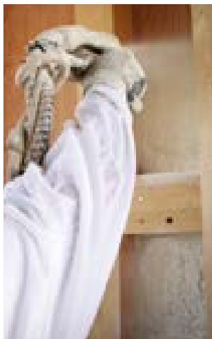
Open Cell Wall Foam Application