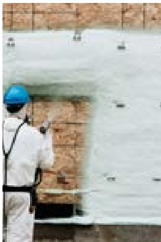
Exterior Continuous Insulation with Closed Cell HFO Spray Foam