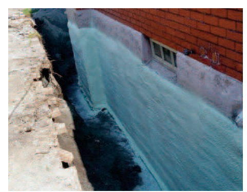
Heatlok HFO is ideal for insulating old concrete or stone foundations from the exterior.