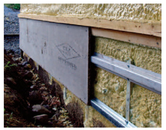
Example of the above-grade portion of the foundation during construction.

What about the above-ground portion of the foundation? Many options are available but one option is to install a structure (Z-bars are recommended) on the above-ground portion of the foundation only. This must be done before applying Heatlok HFO. Once the insulation work has been completed, we recommend installing a light-cement board on the Z-bars. A finish is then applied over the light-cement board once the backfilling has been completed to provide the desired appearance.