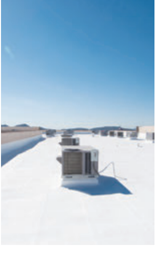
Roofing Foam with Coatings