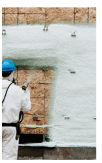
Exterior HFO Application