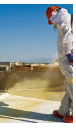
Roofing Foam Application