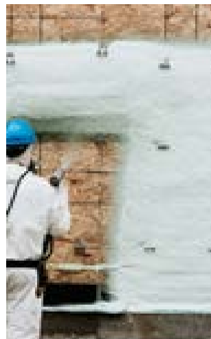
Exterior HFO Application