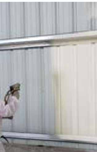
Continuous Insulation with Closed Cell Spray Foam