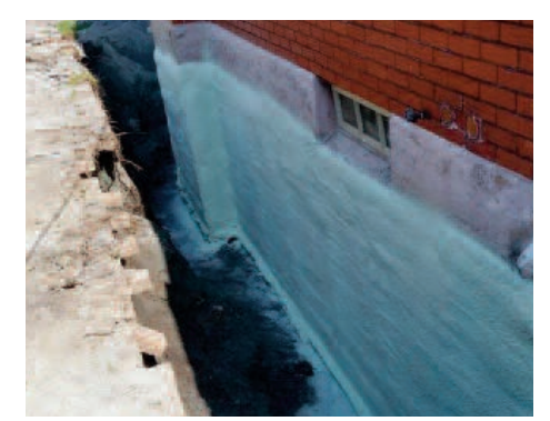
Heatlok HFO is ideal for insulating old concrete or stone foundations from the exterior.