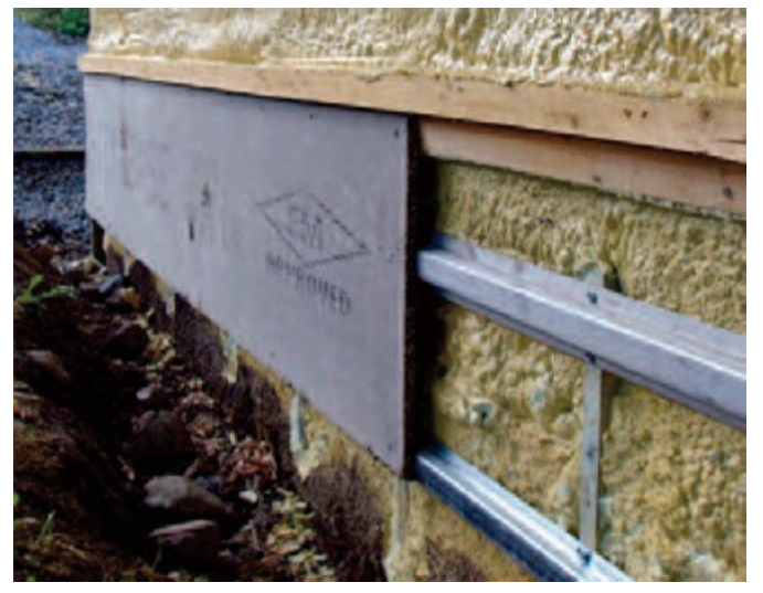
Example of the above-grade portion of the foundation during construction.

What about the above-ground portion of the foundation? Many options are available but one option is to install a structure (Z-bars are recommended) on the above-ground portion of the foundation only. This must be done before applying Heatlok HFO. Once the insulation work has been completed, we recommend installing a light-cement board on the Z-bars. A finish is then applied over the light-cement board once the backfilling has been completed to provide the desired appearance.